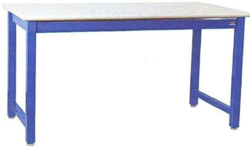
CLEVELAND SERIES WORKBENCH, MODEL CE3672

This report serves to document the testing of the above sample tables to all applicable test paragraphs of ANSI/BIFMA X5.5-2014, tests for office desk and table products. All applicable tests required for complete certification were performed on the largest size sample listed above. Observations were made on all of the smaller sizes of this same series and considered to conform by similarity, as construction details were identical. The remainder of this report will show how the table submitted for testing met the requirements needed for conformance to the stated test paragraphs of the standard.